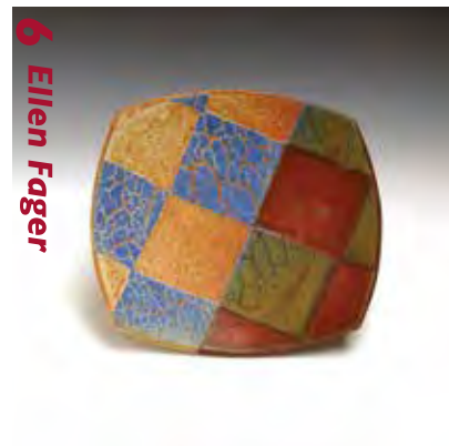
6 Ellen Fager