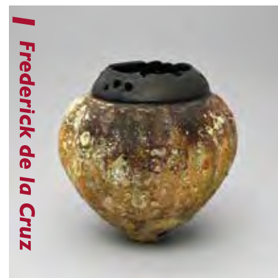
1 Frederick de la Cruz