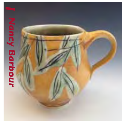
1 Nancy Barbour