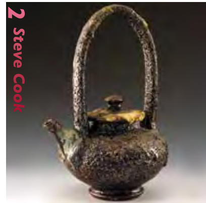
2 Steve Cook