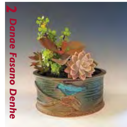
2 Danne Fasano Denhe