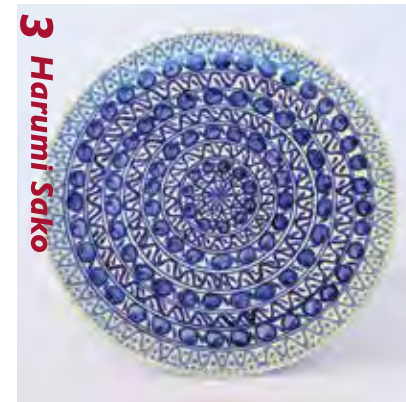
3 Harumi Sako