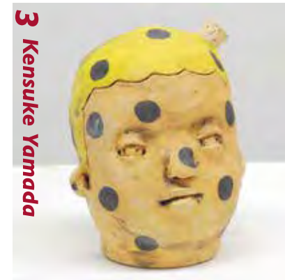
3 Kensuke Yamada