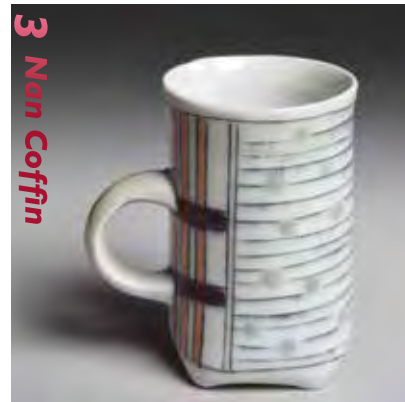
3 Nan Coffin