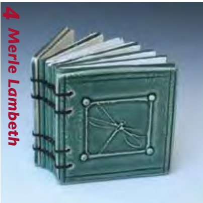
4 Merle Lambeth