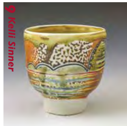
9 Kelli Sinner

San Diego Pottery Tour 2018 The Tour takes place on December 8 & 9, 2018 from 9am to 4pm both days. Rain or shine – it's on! The self-guided tour is FREE! sdpotterytour.com Support local artists!