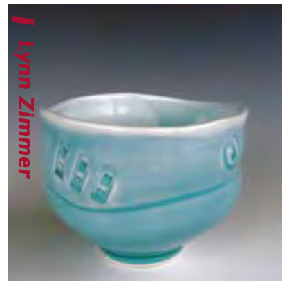
1 Lynn Zimmer