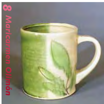
8 Maricarmen Olimón