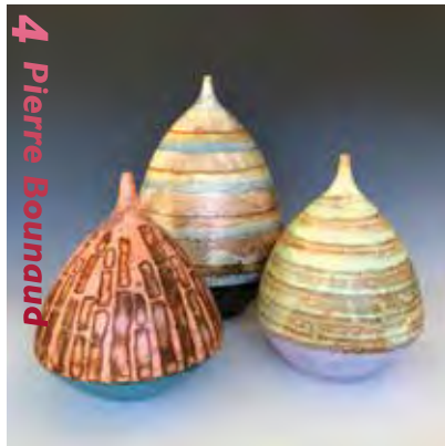
4 Pierre Bounaud