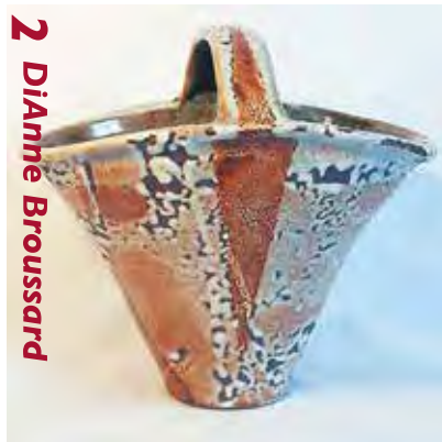
2 Dianne Broussard