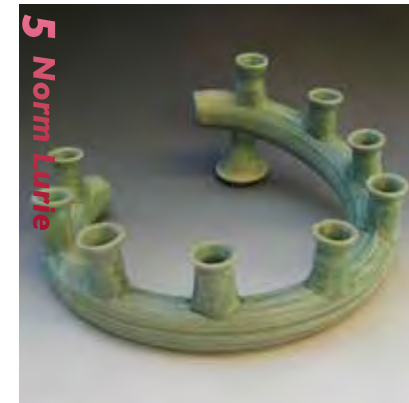
5 Norm Lurie